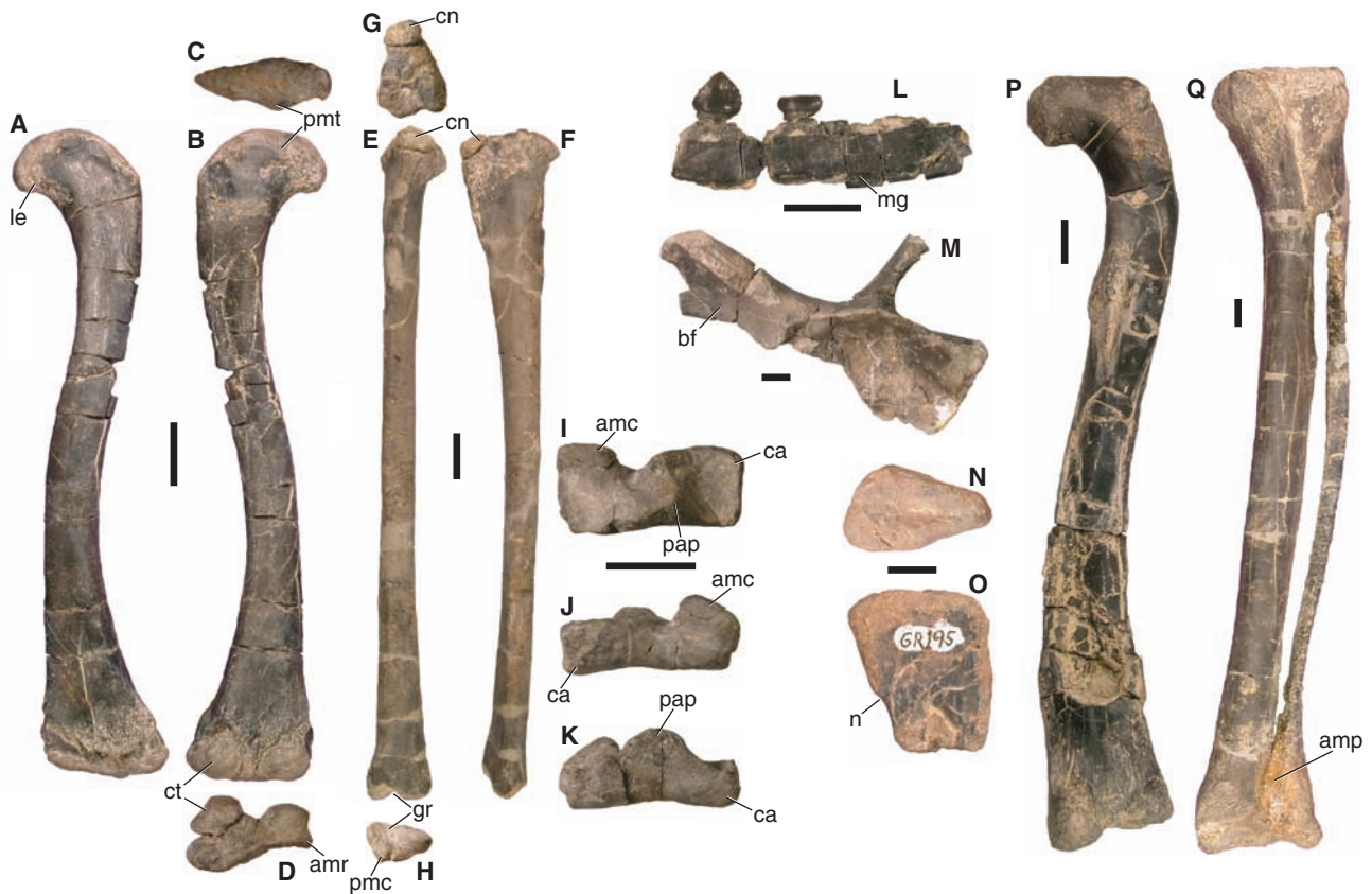
Fig. 2. Dinosauriforms from the HQ. (A to D) Femur of D. romeri (GR 218) gen. et sp. nov. in anterior (A), posterior (B), proximal (C), and distal (D) view. (E to H) Tibia of D. romeri (GR 222) in anterior (E), lateral (F), proximal (G), and distal (H) view. (I to K) Astragalocalcaneum of D. romeri (GR 223) in proximal (I), anterior (J), and posterior (K) view. (L to O) Silesaurus -like dentary (GR 224) in medial view (L), ilium (GR 225) in lateral view (M), and proximal femur (GR 195) in proximal (N) and posterior (O) view. (P) Chindesaurus bryansmalli